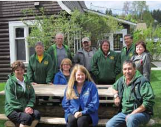
Board members at Taylor House, Whitehorse.

The YHRB may also be asked to make determinations related to ownership of some heritage resources, pursuant to Chapter 13 section 13.3.2.1 and 13.3.6.