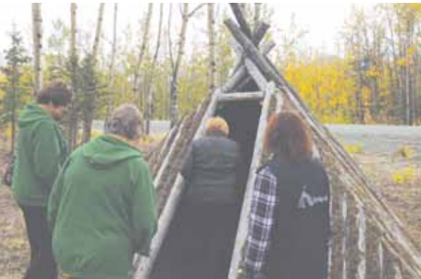
Board members tour the Da Kų Cultural Centre in Haines Junction.

During its meeting in Haines Junction, the board had an opportunity to tour the Da Kų Cultural Centre with Champagne and Aishihik First Nations' staff and learn more about its community and interpretive programming, as well as the tourism and public service offerings of the other governments operating in the centre.