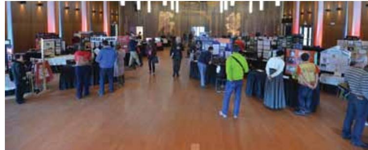
The annual Yukon/Stikine Heritage Fair, held in Whitehorse at the Kwanlin Dün Cultural Centre in May 2014.

The primary focus for this year was mandate-specific training, with members completing courses in administrative justice in preparation for undertaking the board's decision-making mandate. YHRB members also participated in and shared updates on a wide range of heritage-related events over the course of the year. Board members and staff continued to work together to identify and coordinate additional training related to YHRB's mandate. YHRB continued to encourage the Parties to assist with development of training initiatives for Final Agreement Boards and Committees.