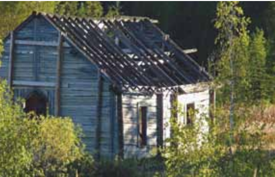
St. Luke's Anglican Church, Rampart House.

The board held its annual community meeting in Old Crow in August of 2008. Board members met with Vuntut Gwitchin First Nation members, staff and Heritage Committee; visited local heritage sites; attended church services; and contributed to and attended the Vuntut Gwitchin General Assembly dinner at Tlo Kut, located on the Porcupine River upstream from Old Crow.