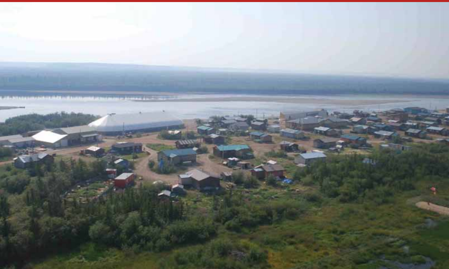
Front: View of Old Crow, 1946 ; Back: View of Old Crow, 2009

Yukon Heritage Resources Board 412 Main Street, Whitehorse, Yukon Y1A 2B7 phone 867-668-7150 fax 867-668-7155 e-mail yhrb@northwestel.net web www.yhrb.ca