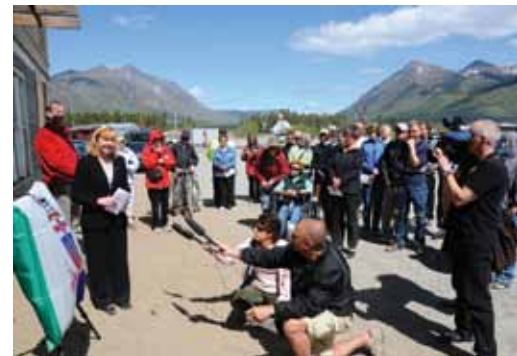
Designation ceremony, Caribou Hotel.

The board will continue to review and update its strategic action plan and keep government apprised of its activities. YHRB will continue to participate in the Historica Fair and will continue to raise its profile by partnering with governments, heritage organizations and the public on heritage issues. Board members will attend heritage events and functions and hold a meeting in a Yukon community each year.