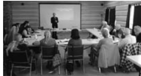
Chapter 13 orientation for new YHRB board members and invited guests.