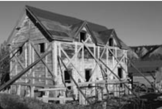
Cadzow House, Rampart House