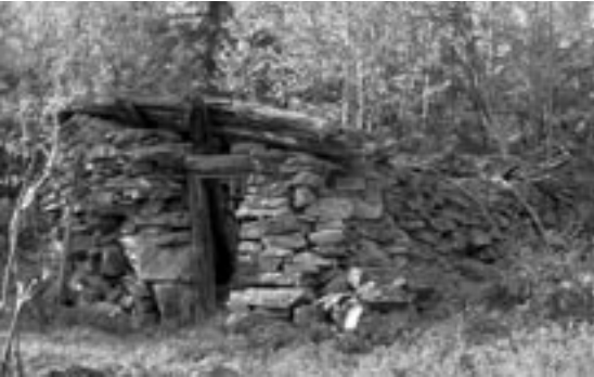
Onek stone house