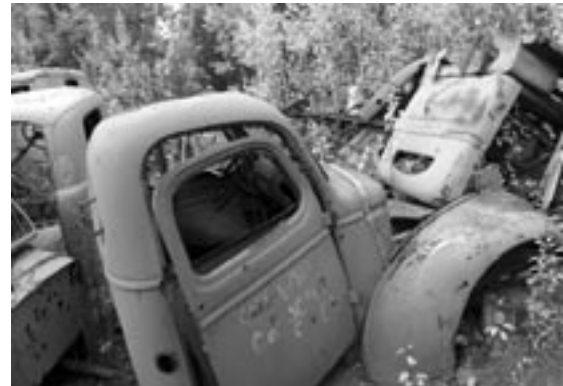
Abandoned U.S. Army vehicles on the Canol Road.