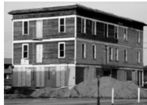
Caribou Hotel, Carcross, undergoing restoration work, 2006

A new board will be appointed in April, 2007. The strategic plan adopted in February will guide the board's work in continuing to develop a process to determine ownership of disputed heritage resources, to support the preservation of Yukon traditional languages and to seek and foster opportunities to heighten public awareness and appreciation of Yukon heritage resources. YHRB will also continue to support partnerships with governments, heritage organizations and the public on heritage issues important to the Yukon people.