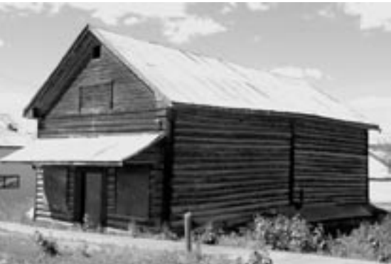
Mayo Legion Hall

The Board recommended to the Yukon Minister of Tourism and Culture that the Caribou Hotel and site in Carcross be designated as a Yukon Historic Site under the provisions of the Historic Resources Act .