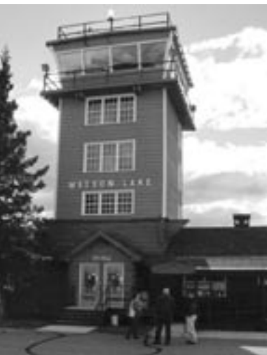
Watson Lake, September 2006.